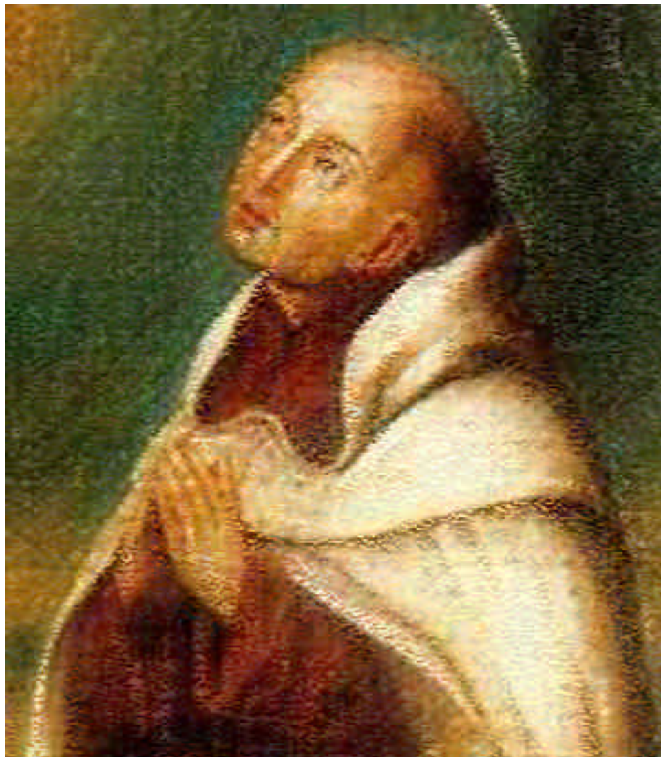
St. John of the Cross